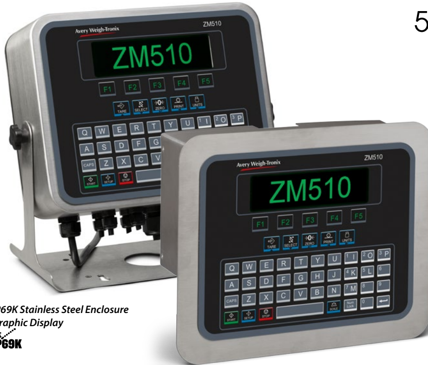
IP69K Stainless Steel Enclosure Graphic Display IP69K