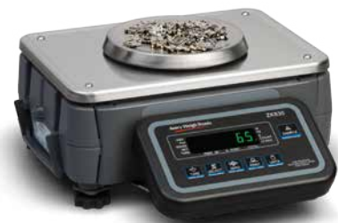
10 lb (5 kg) and 2 lb (1 kg) Models 6 in (150 mm) round platter