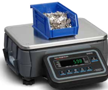
75 lb (35 kg) Model 9 in x 12 in (230 mm x 305 mm) platter