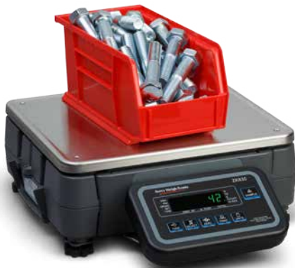
175 lb (80 kg) Model 12 in x 14 in (305 mm x 355 mm) platter

The ZK830 is available with a wide range of capacities from 1 lb up to 175 lb (500g to 80kg) - meeting most application requirements. A high precision scale offering 100,000 divisions (non legal-for-trade) or 10,000 divisions NTEP, OIML and Measurement Canada legal for trade is available.