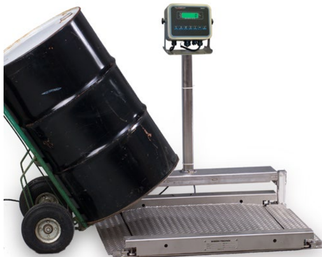
Stainless steel with optional indicator bracket