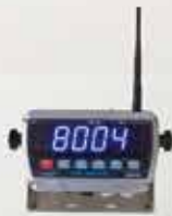
MSI-8004 HD LED Remote Display