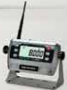
MSI-8000 HD LCD RF Remote Display